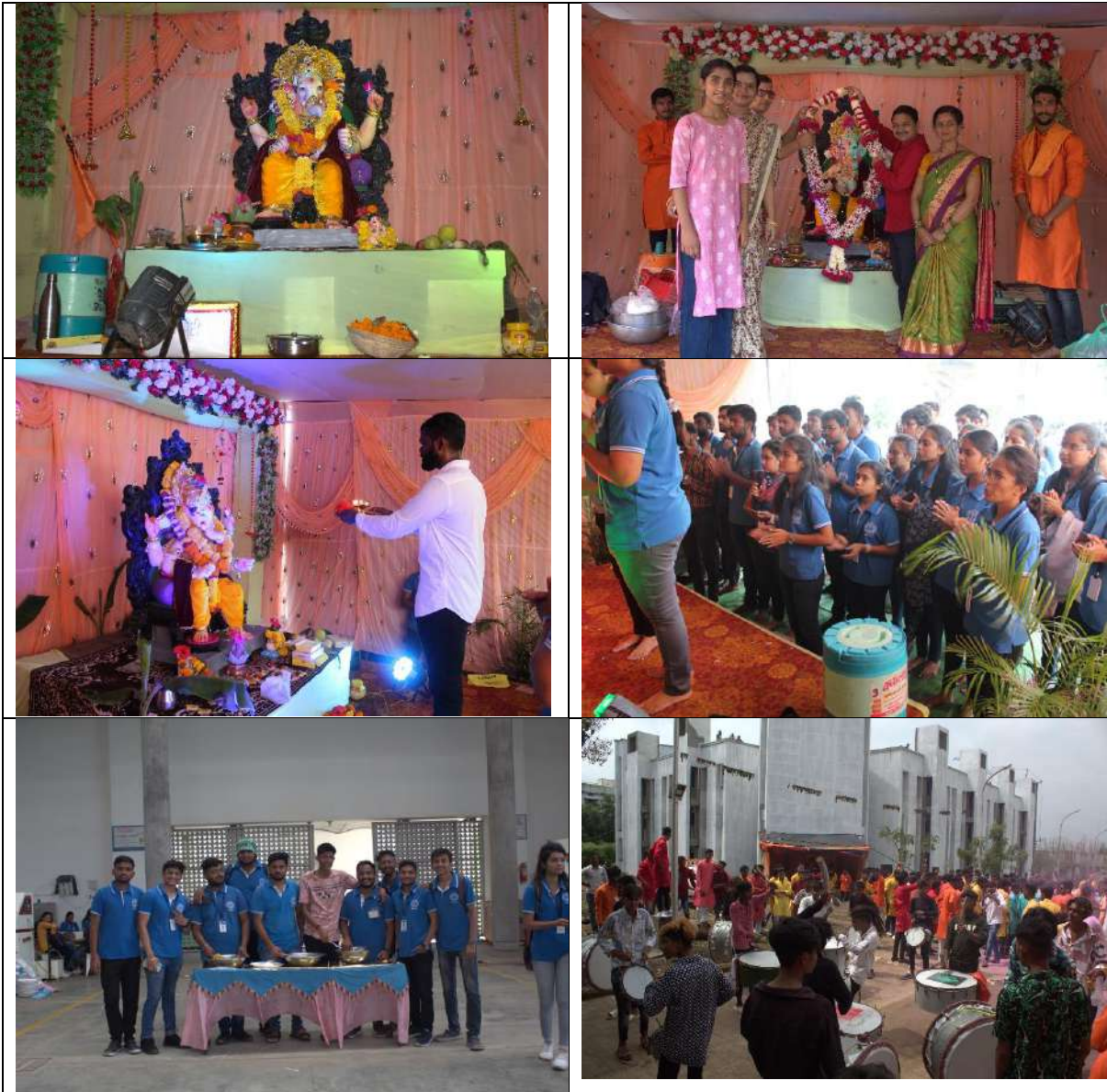
Students Celebrating Ganesh Chaturthi at BIT along with Faculty Members