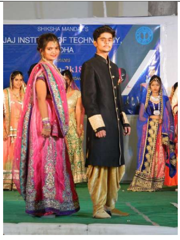
Students participating in 'amBITo' (annual gathering at BIT)